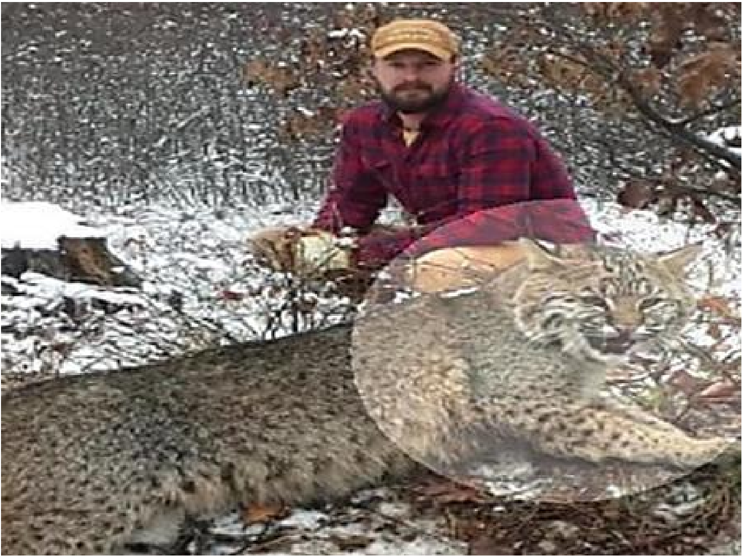
[Gallery] A Man Checks On His Traps, But Finds The Unexpected!