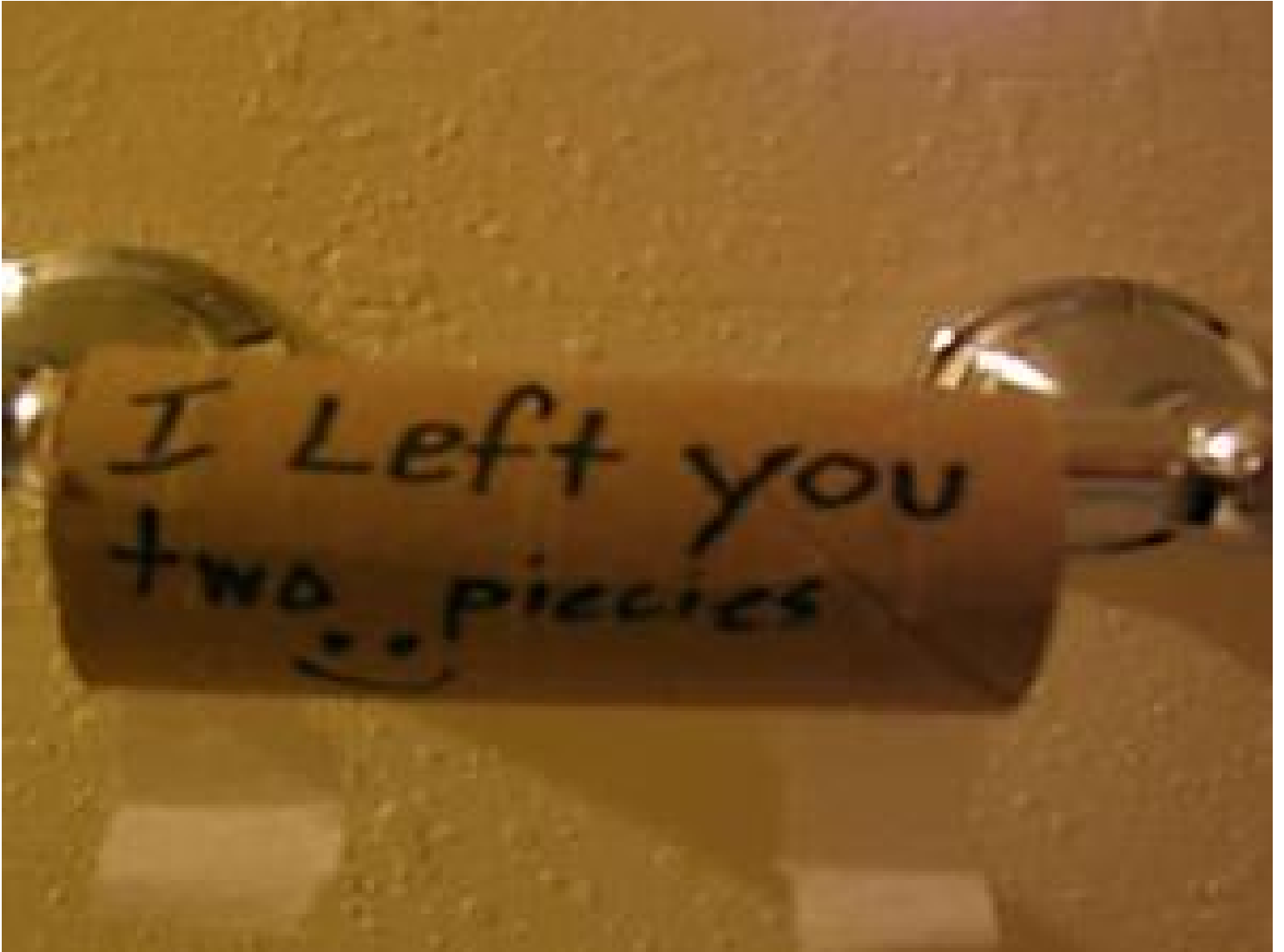
These Wives Hold The Secret To A Happy Marriage. 35 Images